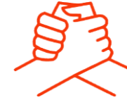
INTERNAL & CLIENT WORK SESSIONS