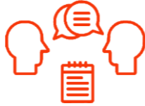
GLOBAL TRENDS & CATEGORY EXPERTS