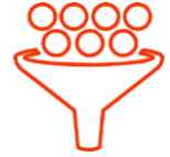
TREND SYNTHESIS & FRAMEWORK CREATION

...to answer your most important and urgent strategic and tactical business questions.