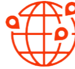
IN-COUNTRY CONSUMER & CULTURAL INFORMANTS